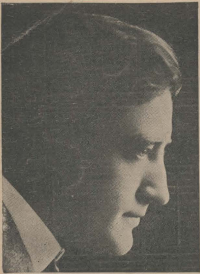
FRANCIS X. BUSHMAN