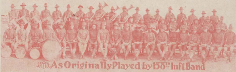
As Originally Played by 158 th Inf. Band

Dedicated to Officers and Men of 40 th Division