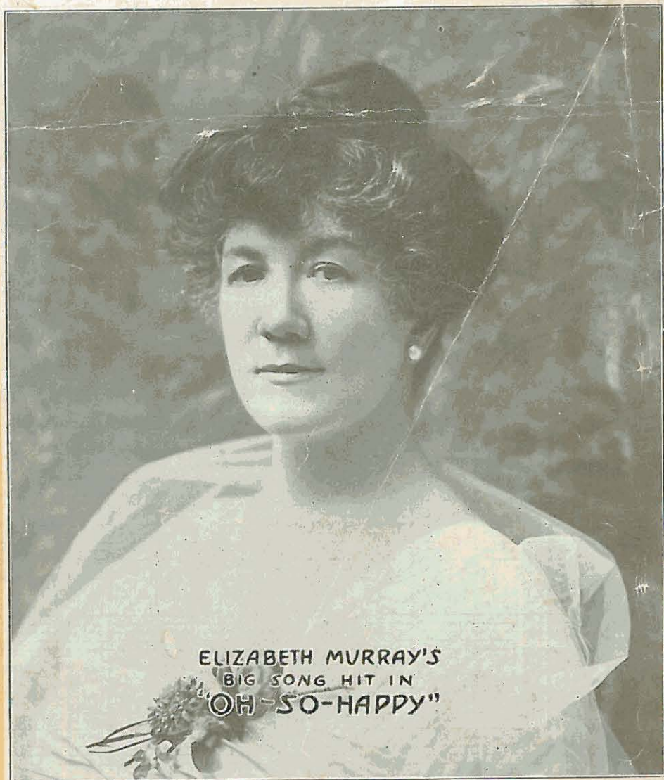
ELIZABETH MURRAY'S BIG SONG HIT IN "OH-SO-HAPPY"