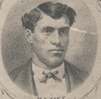
MEYEV RIGHT FIELD