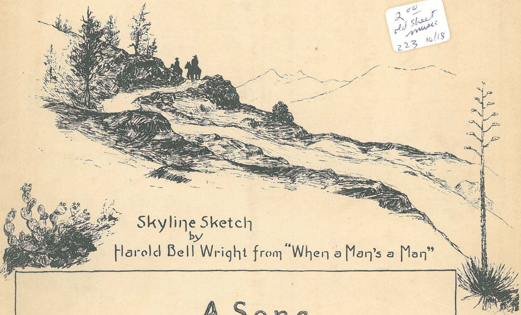
Skyline Sketch by Harold Bell Wright from "When a Man's a Man"