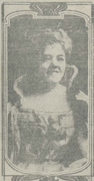
MISS MARIE CAHILL SINGING "NANCY BROWN"

Why the Hit Made by "Nancy Brown" Doesn't Please Men Who Wrote "The Wild Rose."