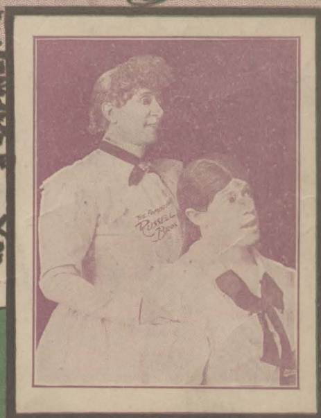
THE FAMOUS RUSSELL BROS