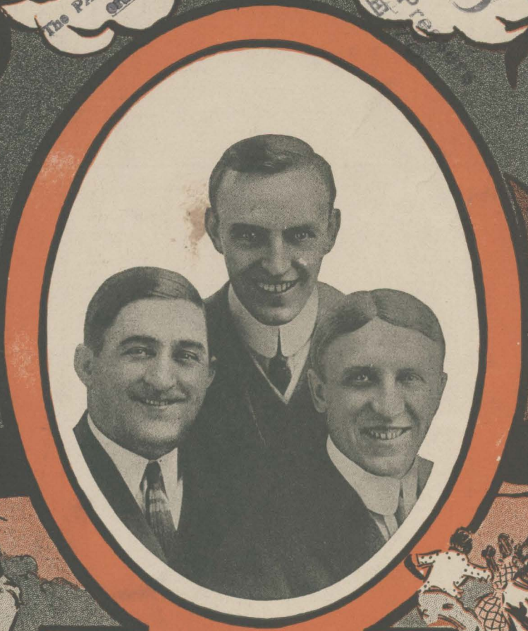
TUXEDO TRIO IN "WAY DOWN HOME"

The D. D. FALLAHER Cleaners and Pressers