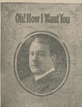
Great Waltz Ballad

Copyright, MCMXV, by Frank K. Root & Co. British Copyright Secured