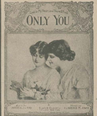
Waltz Song Hit

Copyright, MCMXV, by Frank K. Root & Co. British Copyright Secured