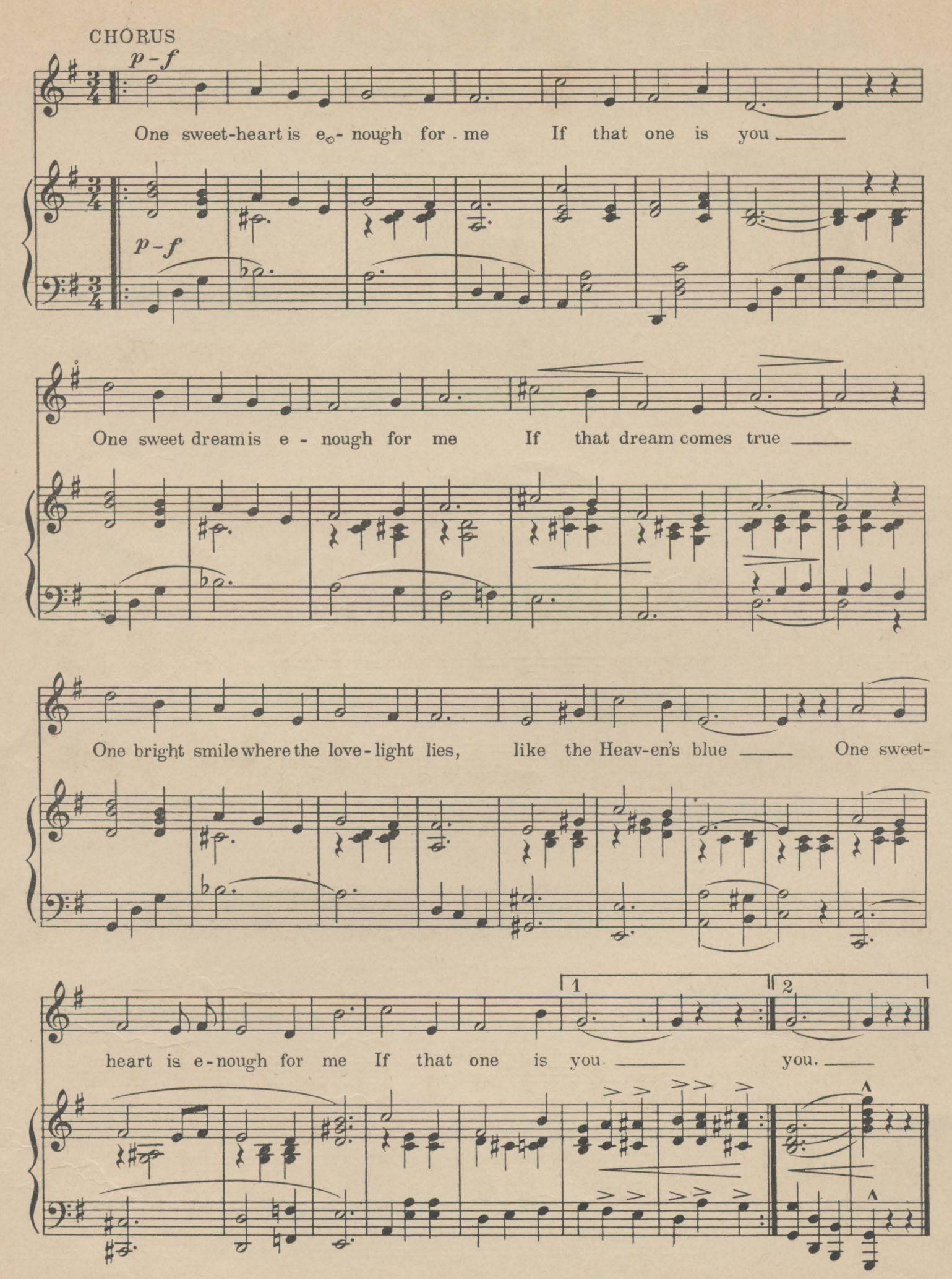
One Sweetheart is Enough for Me-3-3