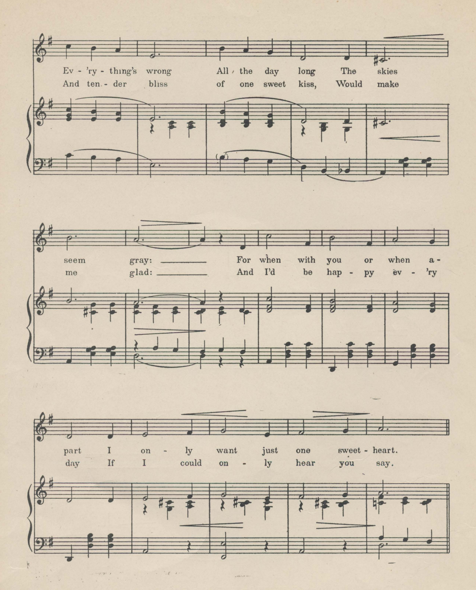
One Sweetheart is Enough for Me-3-2