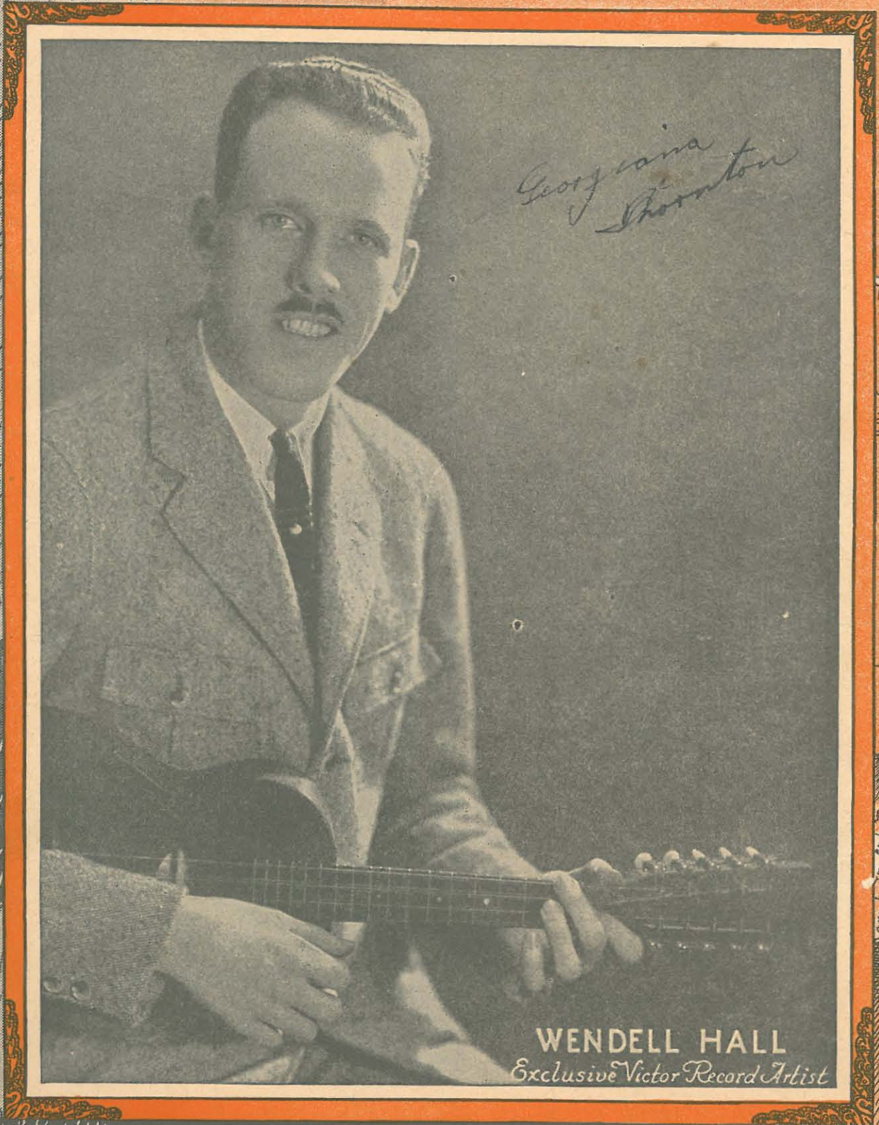
WENDELL HALL Exclusive Victor Record Artist

As sung by the National Radio Favorite - The Composer On Victor Records