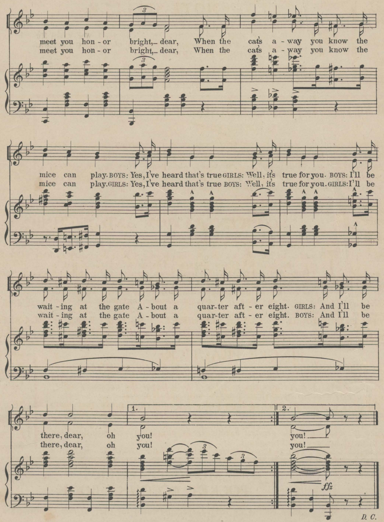
M.W. & Sons 12611-4