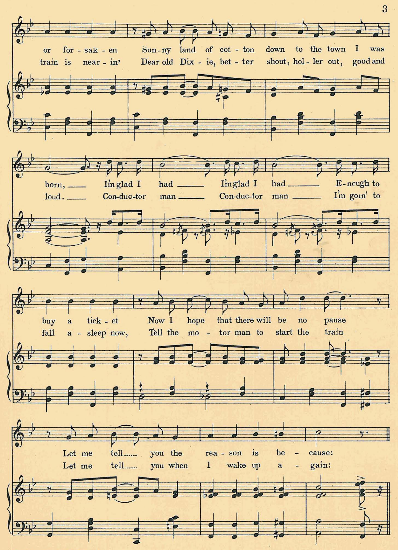
I'm Going Back To Dixie .= 4.