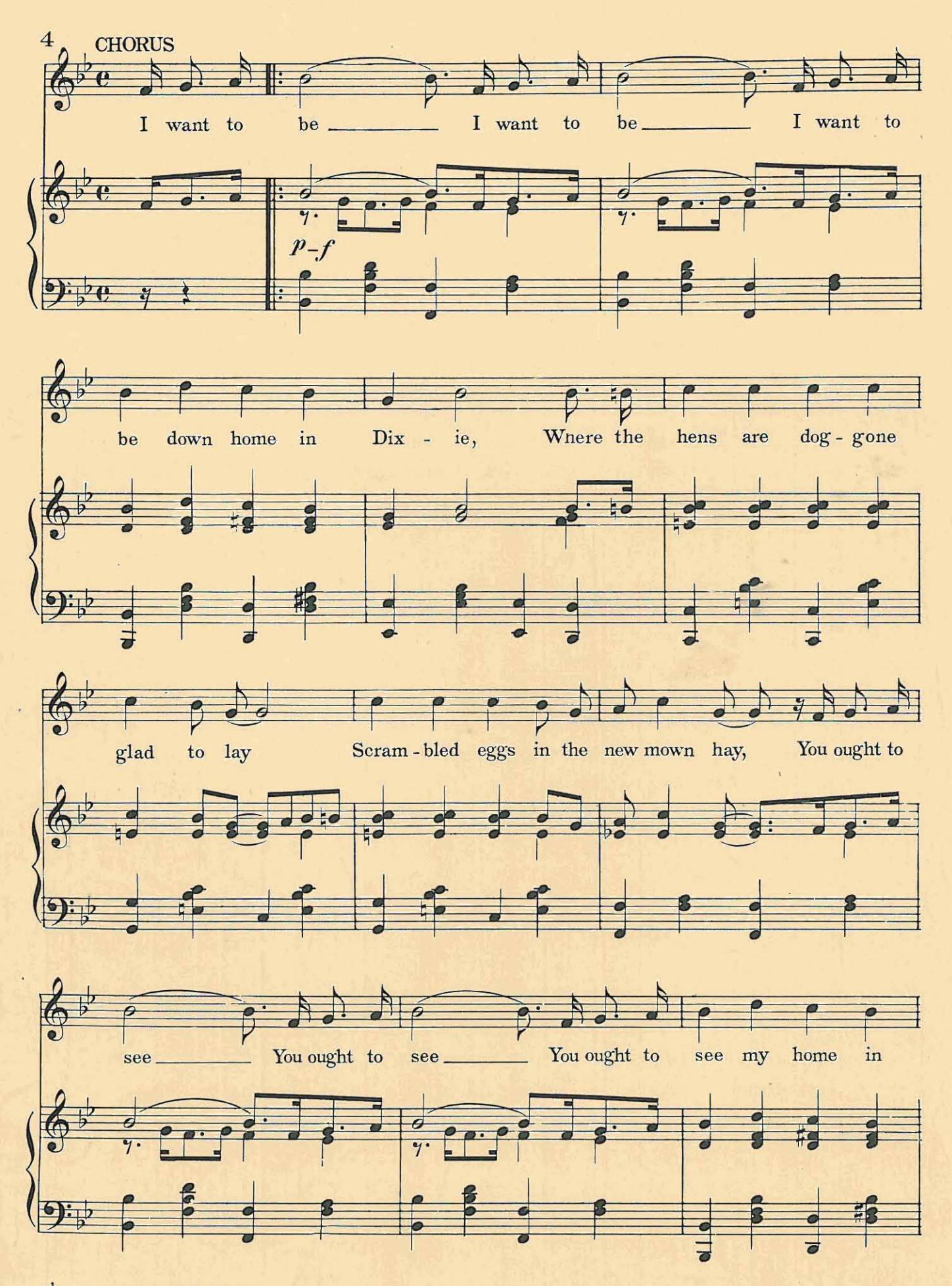
I'm Going Back To Dixie.=4.