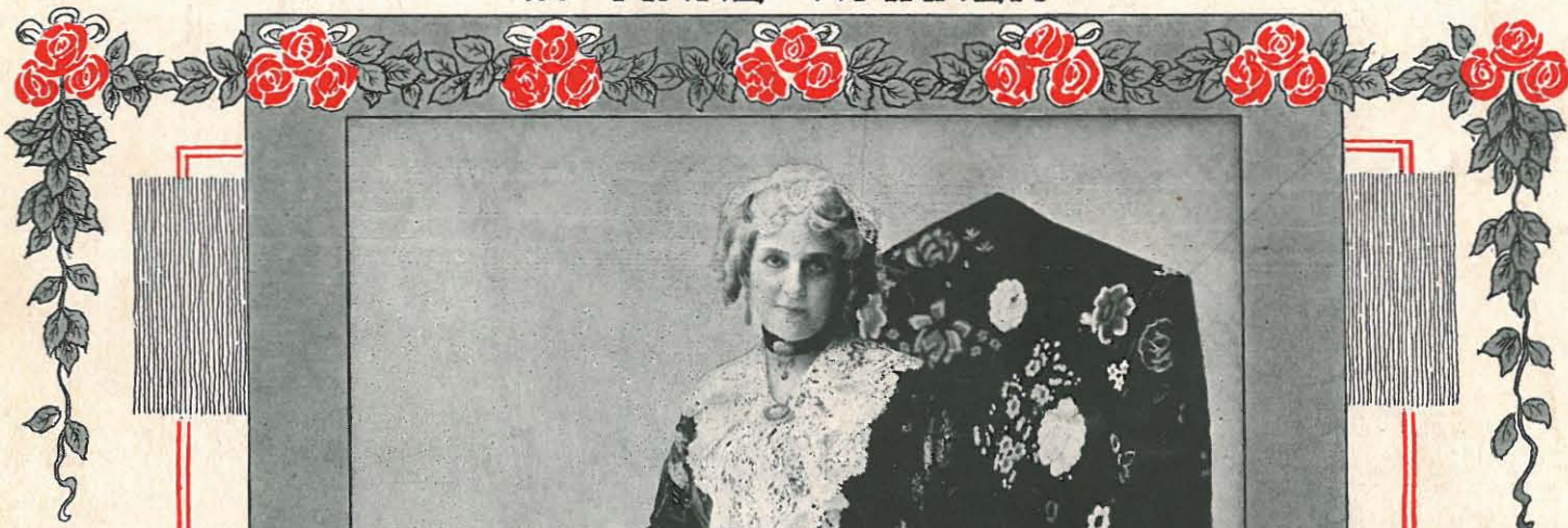
May Robson as "Aunt Mary"