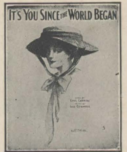
A Charming, Melodious Song