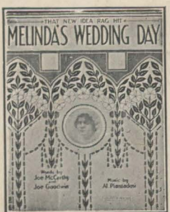
A HIT FROM COAST TO COAST