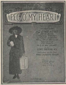
The Hit of "Peg O' My Heart" Show.