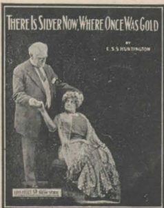
EVERYBODY LOVES IT!