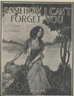
SWEET AND CATCHY MELODY