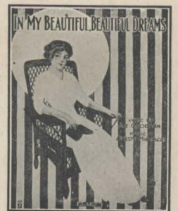
The Most Entrancing Melody You Ever Heard