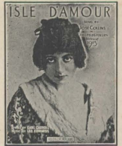
"FOLLIES OF 1913" Semi-Classical