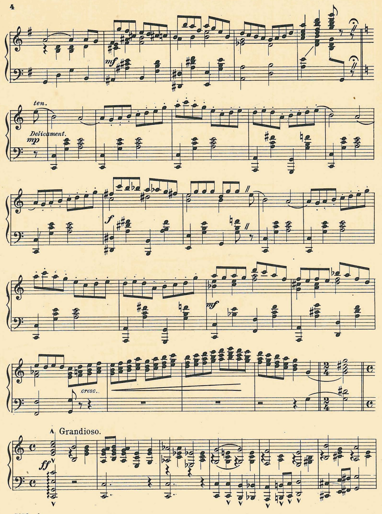
7076 - 4