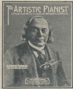
VLADIMIR DE PACHMANN